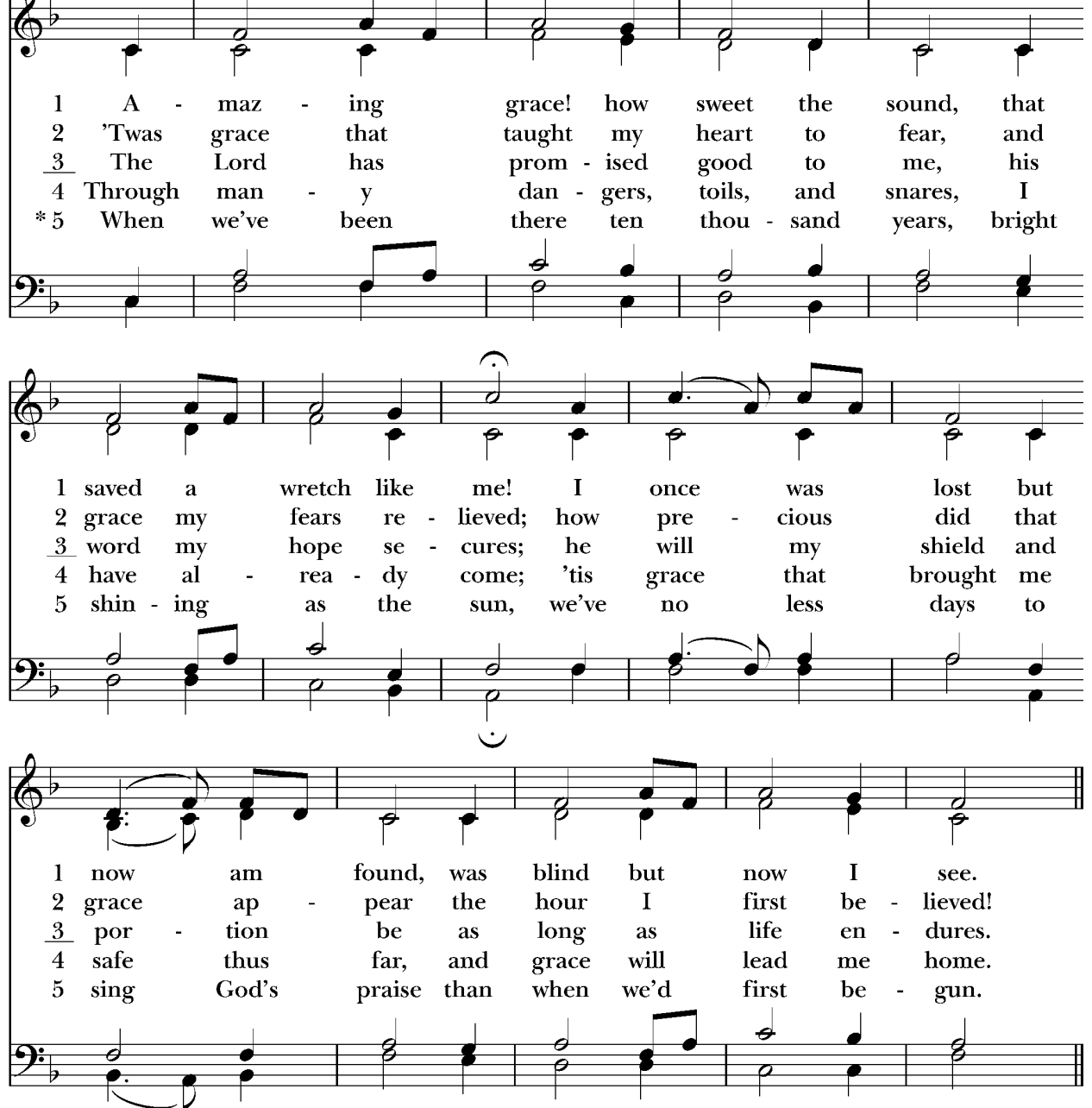
The melody may be sung in canon at distances of either two or three beats.